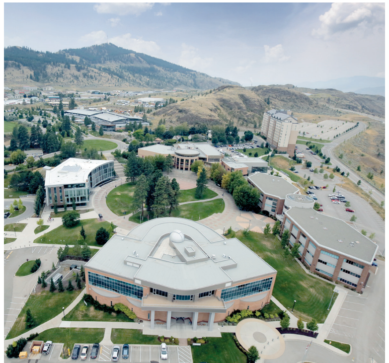
TRU Campus, located in the heart of Kamloops

For over 30 years, Thompson Rivers University (TRU) has been delivering customized training programs of the highest calibre, earning us worldwide recognition. Our intensive, short-term programs are strategically balanced to maximize learning opportunities while allowing participants enough time to gain an appreciation of Canadian culture and participate in carefully selected activities. The result is a rich and rewarding experience that will last a lifetime.