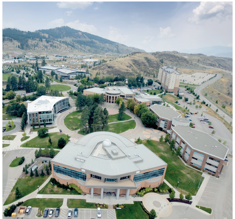
TRU Campus, located in the heart of Kamloops

For over 30 years, Thompson Rivers University (TRU) has been delivering customized training programs of the highest calibre, earning us worldwide recognition. Our intensive, short-term programs are strategically balanced to maximize learning opportunities while allowing participants enough time to gain an appreciation of Canadian culture and participate in carefully selected activities. The result is a rich and rewarding experience that will last a lifetime.